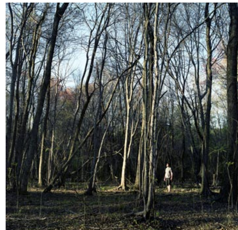
—— Work by Zane Logan

ating physical objects as well as video and sound, collecting these raw materials in