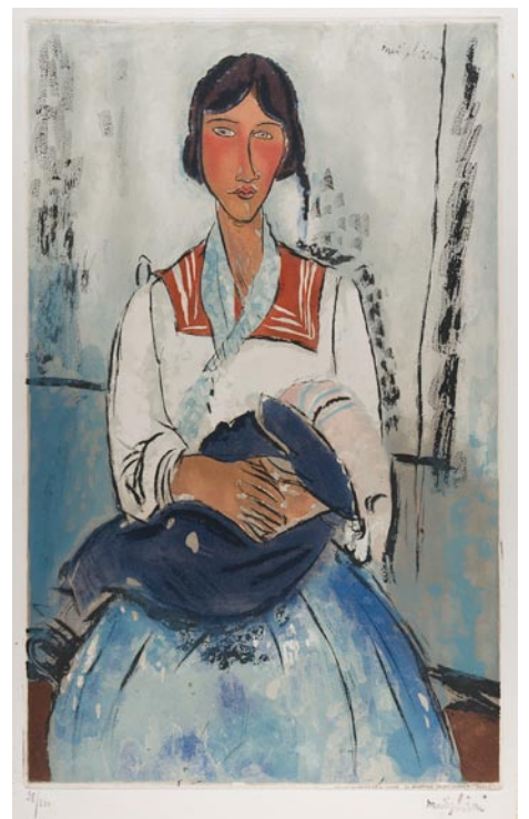
Jacques Villon, L'Italienne d'après Modigliani (The Italian Woman after Modigliani), 1926, aquatint on paper, 26 x 19 7/8 in. Bequest of Etta and Claribel Cone, 1949.

Part of this vanguard collection will be on view this fall and winter as a complement to the exhibition, Collecting Matisse and Modern Masters: The Cone Sisters of Baltimore , on view at the Nasher Museum