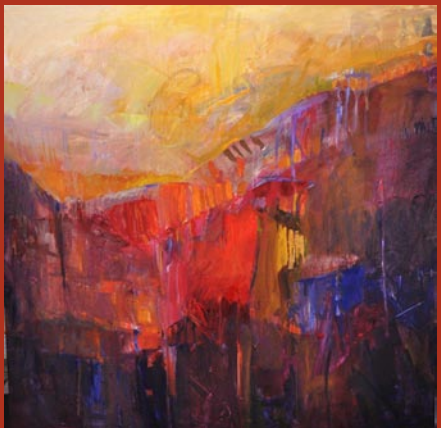
Summer Heat, oil on canvas www.LauraLiberatoreSzweda.com Contemporary Fine Art by appointment