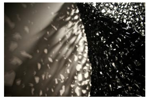
Work by Sally Garner

NC Institutional Gallery listings, call the art Department at 828/251-6559 or visit ( http://art.unca.edu/ ).