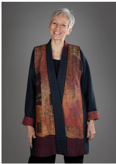
Work by Liz Spear

Commercial Gallery listings, call the gallery at 828/688-6422 or visit ( www.micagallerync.com ).