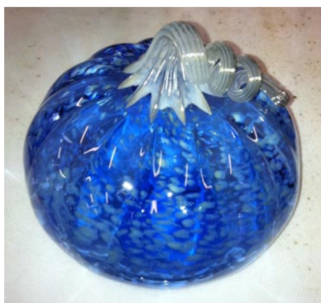
Work from Foundry G