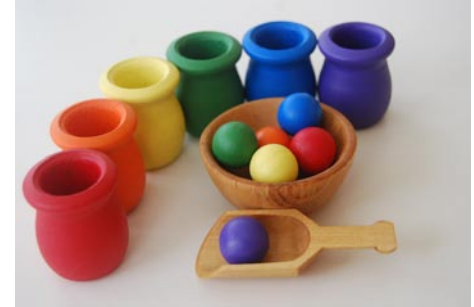
Works by BumbleFly-N-ButterBees

To view all of our 2013 vendors, please visit the Crafty Feast website at (http://www.craftyfeast.com/VENDORS. html).