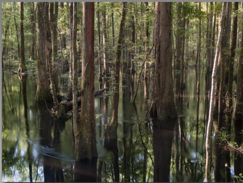
Great Swamp #1, Jasper County SC. 041613