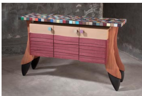
Work by Brent Skidmore

A number of national artists will display works that include sculpture, basketry, glass, fiber, metal, clay, jewelry, woodworking and assemblage. Entries were selected by a jury using the criteria of artistic excellence, innovation and originality. Cash prizes in the amount of $1,500 will be awarded by exhibit judge Wally Smith, owner of Smith Galleries in