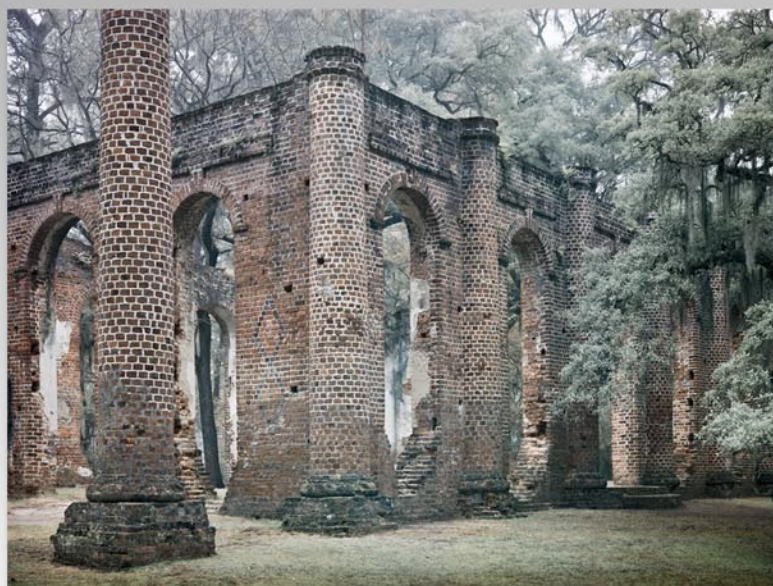
Sheldon Church ruins, Beaufort County SC 11611