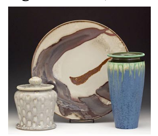
Works from Bulldog Pottery

most recent happenings in their studio at "Around and About with Bulldog Pottery" at (www.bulldogpottery.blogspot.com).