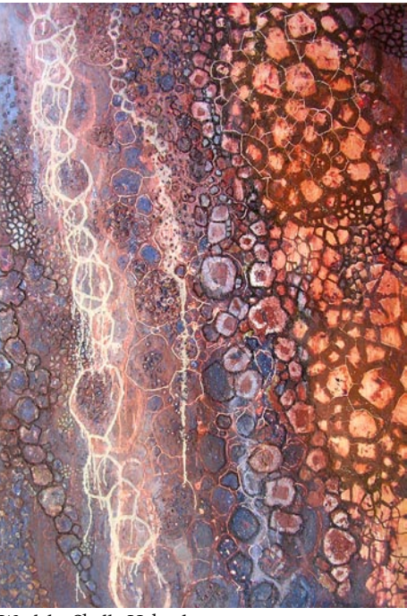
Work by Shelly Hehenberger

317 Pollock St Downtown New Bern, NC 252-633-4369 Open 7 days