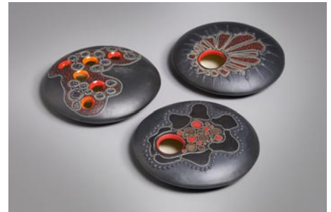
Work by Sasha Bakaric

The show Intersections consists of three artists' unique visions of universal form, and