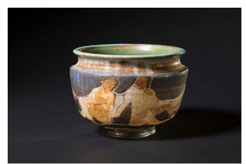
Work by Mayco, Duncan, Amaco Glazes, Slip Bisque, Highwater Clay, Clay Tools