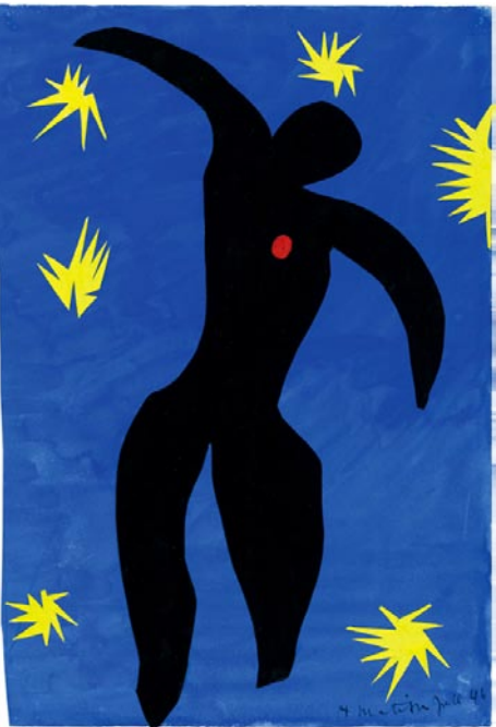
Work by Henri Matisse.

USC-Upstate in Spartanburg, SC, is presenting Finding Language, featuring art of Mary Robinson, whose dreamlike works evoke images of chaos and elemental forces, on view in the UPSTATE Gallery on Main, through Dec. 30, 2017. Drawing upon our complex and tumultuous relationship with nature, Robinson's artworks invoke both the fluidity of the natural world and the intermittent - and at times dramatic - reconfigurations due to natural disruption and renewal. Often mixing and remixing printmaking matrices along with cutting up and reconstructing prior paintings and drawings, the resulting enigmatic and dream-like images echo the interplay and chaos of elemental forces at work in the world around us. Robinson is an associate professor of art and head of printmaking at the University of South Carolina. For further information call Jane Nodine at 864/503-5848 or e-mail to (jnodine@uscupstate.edu).