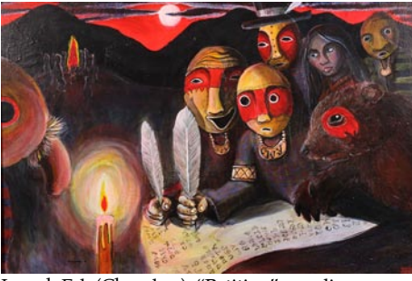
Joseph Erb (Cherokee), "Petition", acrylic on

Our policy at Carolina Arts is to present a press release about an exhibit only once and then go on, but many major exhibits are on view for months. This is our effort to remind you of some of them.