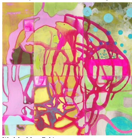
Work by Mary Robinson

this exhibition, Grand Strand Collects, the Museum presents more than 200 works of art varying from ancient Egyptian artifacts and historical prints to modern and contemporary sculpture and paintings, on loan from 49 private Grand Strand collections. For further information call the Museum at 843/238-2510 or visit (www.MyrtleBeachArtMuseum.org).