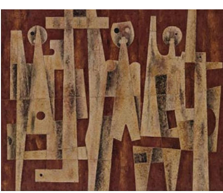
Carlos Mérida, "Abstract with Three Figures", 1961, oil, sand, and pencil on wood, 345/8 \times 413/8 \times 13/8 in.

Pan American Modernism: Avant-Garde Art in Latin America and the