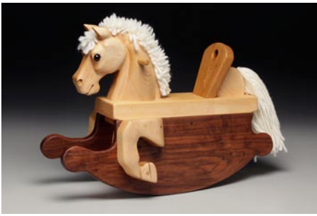
Work by Heartwood Rocking Horses

Today, Grovewood Gallery offers two expansive floors of finely crafted furniture, ceramics, jewelry and more, contributed by over 400 artists and craftspeople from across the United States. The gallery also boasts an outdoor sculpture garden and presents rotating exhibitions throughout the year. For more info check our NC Commercial