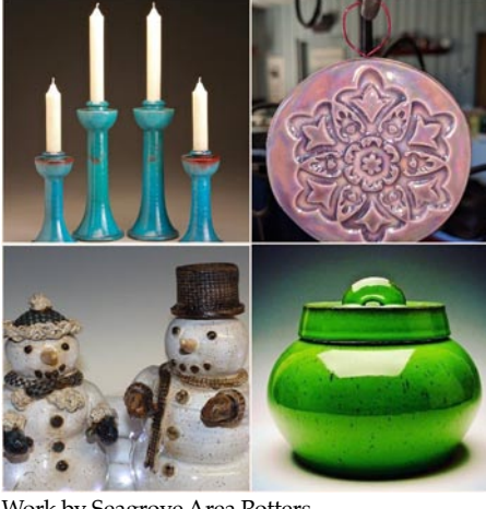
Work by Seagrove Area Potters

Throughout the Seagrove area, Saturdays Dec. 1, 8, &15 - "Holiday Open House," in Seagrove, NC. Join the Seagrove Potters this season for their annual "Holiday Open House". You're invited to celebrate the holiday season on a self guided pottery tour. Already have plans for those weekends? Don't be dismayed, shops are open during the week too!. Enjoy decorations and complimentary refreshments as you find something for everyone on your list this year. Experience a hearty does of holiday cheer, feel the warmth of the fireplaces, our hearts and our wit as you venture through the Seagrove community. Each participating shop has listed their event details on our website. Complete information about this years Holiday Open House can be found at (http://discoverseagrove.com/holiday-open-house-2018/). Pickup an Area Map and Guide at your first stop. Free and open to the public! For a full listing of participating shops visit the Seagrove Potters website at (www.CelebrationofSeagrovePotters.com).