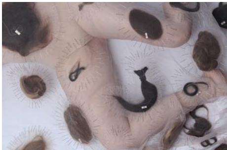
Work by April Dauscha

The work uses materials that mark the passage of time - hair, veiling, corsage pins, historical garments, and family heirlooms - materials that are associated with rites of passage. They are the remains of our corporeal existence - prompts to memory, nostalgia, and melancholy. Here, bodies come into direct contact, and in symbolic conversation, with familial objects that function as relics - covering, wrapping, shrouding a faceless form. It becomes an idealized ritual, enacted in anticipation of one's own death, and an interaction of the living with the deceased. Moving images act as metaphors for corporeal weight and inescapable gravity.