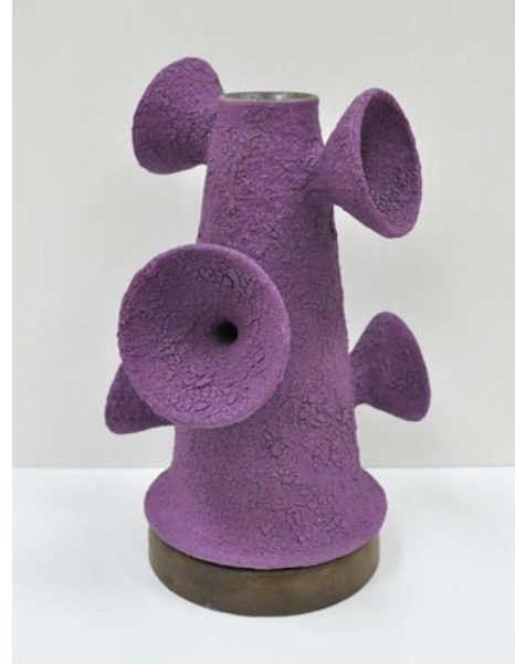
Virginia Scotchie, "Object Maker Series", 2020, glazed stoneware. Asheville Art Museum. © Virginia Scotchie.

Ceramics often serve a practical purpose and fired clay is traditionally used to make coffee mugs, plates, and vases - many of the things we use every day and have for hundreds of years. Around 1870, cerami-