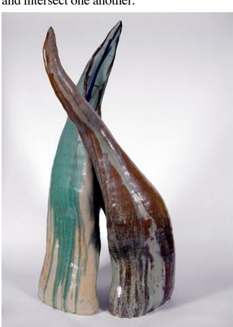
Jane Palmer, "Untitled", circa 1990, glazed stoneware, 41 \times 14 \frac{1}{4} \times 21 \frac{1}{2} inches. Asheville Art Museum. © Estate of Jane Palmer.

"Fantastical Forms: Ceramics as Sculpture will offer visitors the chance to see a selection of large-scale ceramic works of art from the Museum's Collection," says Richardson. "Many of these sculptures have either not been seen for years or have never been seen before by the public. We're excited to bring not just one, but several colorful and imaginative sculptures out to be displayed together to create their own fantasy world. Several artists in the exhibition have a student-teacher relationship and it's fun to see how their styles run parallel and intersect one another."