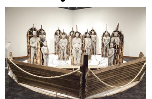
Works by Stephen Hayes

4.5 - 8 feet tall. They are made of cement, fabric, steel and fire-treated wood. In addition to the figure sculptures, the exhibition includes hand-made steel chains connecting the sculptures; prints and drawings; a large, wall-mounted sculpture of a ship; and scores of wooden, fire treated boxes, 11 x 21 inches in size, containing cement casts of ship shapes, that will be installed as a wall.