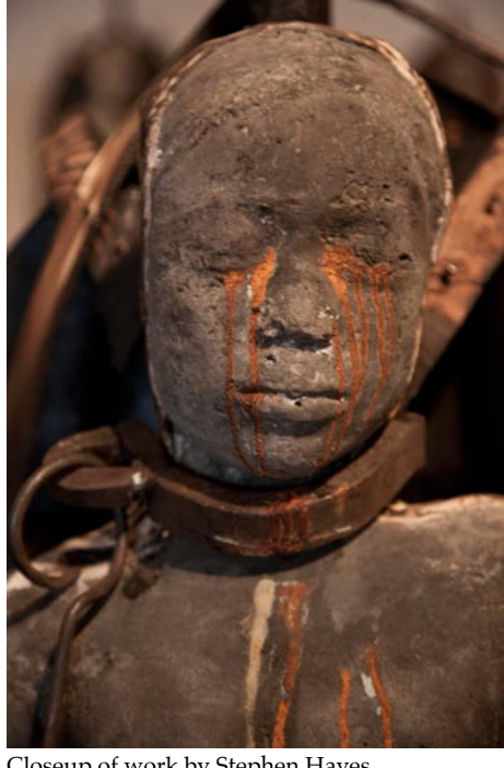
Closeup of work by Stephen Hayes

At the core of Cash Crop are 15 lifesize sculptures of shackled people placed in boat- or coffin-like structures, with diagrams of captive, warehoused humans in Trans-Atlantic slave ships carved in wood on the back. The sculptures represent, Hayes says, "the 15 million human beings kidnapped and transported by sea during the Trans-Atlantic slave trade." Through these works and others in the exhibition, Durham, NC, native Hayes invites the viewer into an emotional, physical and psychological space to confront past, present and future.