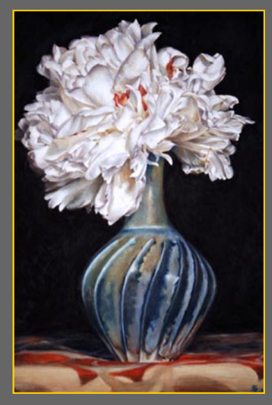
Last Spirit 36" x 24" oil pastel on canvas

Artist Reception, Friday, February 7th 5:00 - 8:00 p.m.