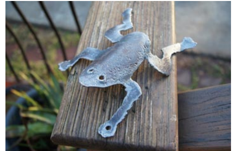
Work by Gary D. Marshall

More than 100 artists responded in support of Thirion's call, contributing 190 original paintings, sculptures and photos, which are on display throughout the month. Proceeds from art sales will be used to expand the Project to other cities. The Project also includes presentations with films and discussions led by environmental experts. A puppet show for the youngsters raises environmental awareness with a cast of frogs. The project closes Feb. 22 with an evening of music, poetry and discussion.