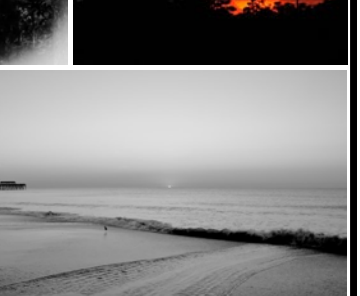
Mon-Sat: Noon - 7 PM Gallery Hours: Sun: Noon - 6 PM

3032 Nevers Street Myrtle Beach, SC 29577 at The Market Common www.seacoastartistsguild.com seacoastartistsgallery@gmail.com Gallery phone: 843-232-7009