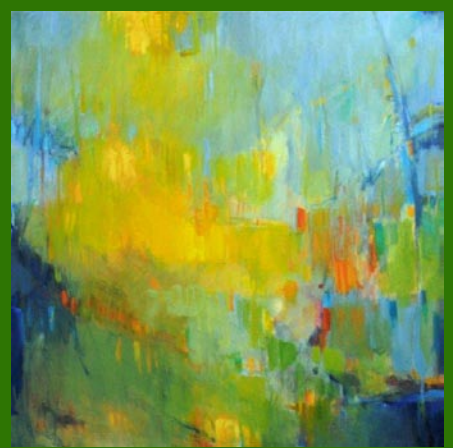
See The Light oil on canvas 30" x 30"

www.LauraLiberatoreSzweda.net Contemporary Fine Art by appointment