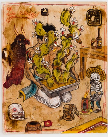
Work by Rául Gonzales III