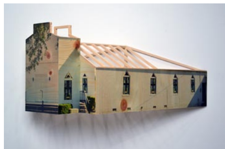
"Gum Spring Baptist, Pageland, SC," 2014 by Frank Poor

Richland County Public Library , Gallery at Main, 1431 Assembly St., Columbia. Ongoing - Featuring 20 pieces of public art on permanent display. Hours: Mon.-Fri., 9am-9pm; Sat, 9am-6pm; Sun, 2-6pm. Contact: 803/988-0886 or at ( www.richland.lib.sc.us ).