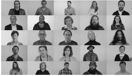
A composite of images of the 25 artists