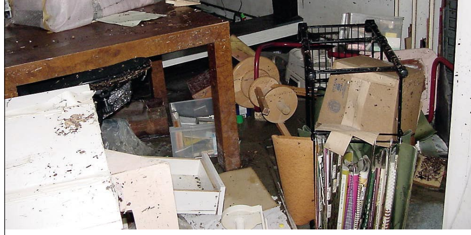
Artist Diane Falkenhagen's Texas studio — destroyed by flooding during Hurricane Ike, 2008

What would you do if you lost your work, your tools, your images, and a lot more to a flood? Metalsmith Diane Falkenhagen knows