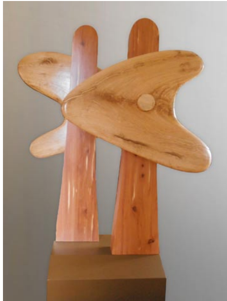
Work by Don Green

The inspiration for Don Green's New Work comes from and is influenced by nature, trees, streams, roots, rocks, hills, and the processes of life: creation, new growth, death, decay, erosion, the changing seasons.