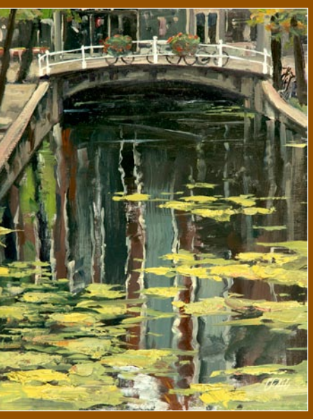
Delft Lilies 14" x 11", Oil on Canva

Exhibit on view February 7 - March 3, 2020