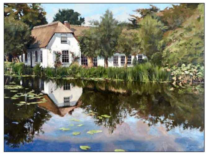
Welcoming Reflections 30" x 40", Oil on Canvas

Marsala Salt Flats 20" x 16", Oil on Canvas