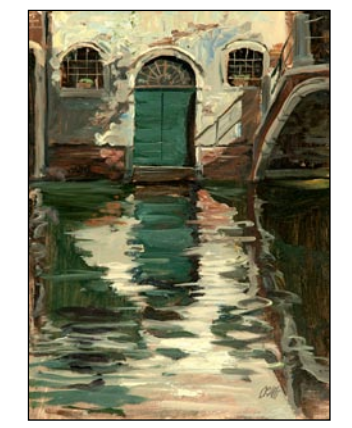
The Green Doorway 16" x 12", Oil on Canvas

Mirroring the character of Charlestons' French Quarter itself, Craig Nelson's paintings have a timeless quality. Stroll by stately European facades and sweeping land- and waterscapes where the past and present mingle. His masterful brushwork brings the textures of stucco, stone, sunlight and rain to impressionistic life on his canvases.