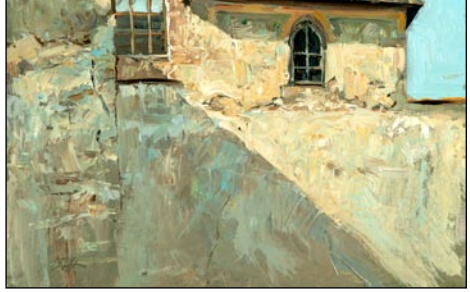
Weathered 12" x 16", Oil on Canvas