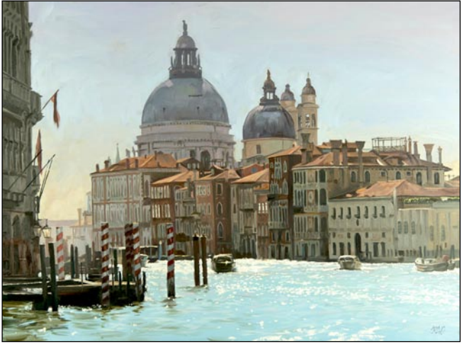
The Grand Canal 30" x 40", Oil on Canvas

Sicilian Interior 14" x 11", Oil on Canvas