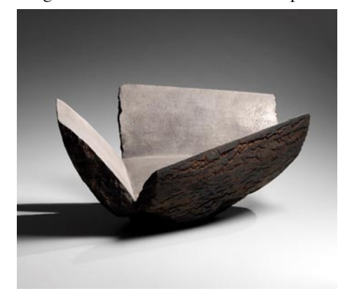
Akiyama Yō, Japanese, born 1953, "Untitled", MV-155, 2015, unglazed stoneware with silver coating, 95/8 x 223/8 x 15 in. Carol and Jeffrey Horvitz Collection

Visitors to Open the Shape Called Love will experience a smaller-scale, more contemplative, handmade side of Yayoi Kusama, a revered contemporary artist known primarily for her large-scale blockbuster installations. Included in the Ackland's exhibition are early works on paper, intimate "dot" and "net" paintings, provocative sculpture and multimedia work, and a tabletop mirror box, all of which provide insight into Kusama's later artistic output.