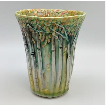
Work by Heesoo Lee

CUPful features hundreds of mugs and cups handcrafted by artists from across the United States. Each artist is sending a limited quantity, so visit early, choose your favorite, make a cup of coffee here and take it home to enjoy!