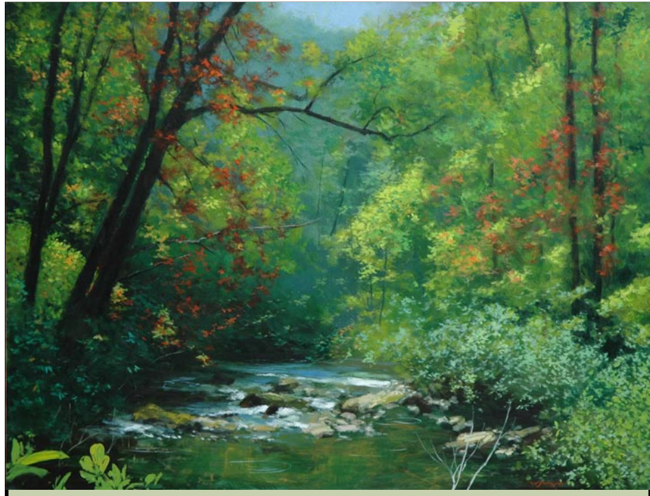
Late Summer on the Chattooga River