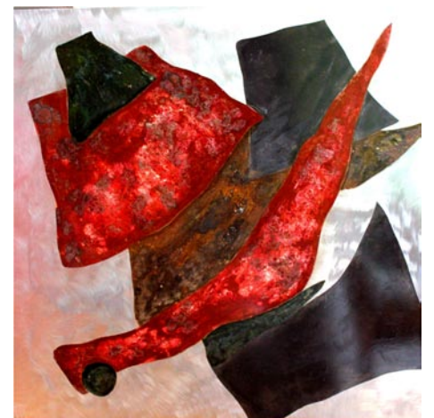
Work by Wayne Carrick

of each piece can be observed. They have been planned, but cannot be relied upon. "Much like the crashing of waves on the shore, you can participate but certainly cannot control the outcome," say Carrick. "For some, you may dabble from the safety of the shore, but for others, if you are to participate fully, it is in the crest of the wave, almost crushed; this is where the work lives and it is most vulnerable."