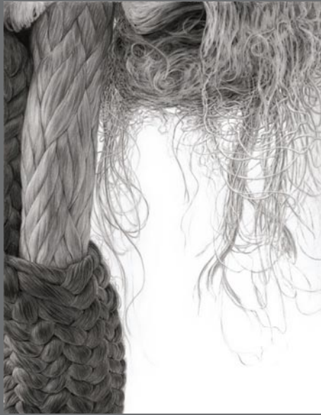
Fuzzy Logic, 50 inches x 38 inches, charcoal on paper, 2007