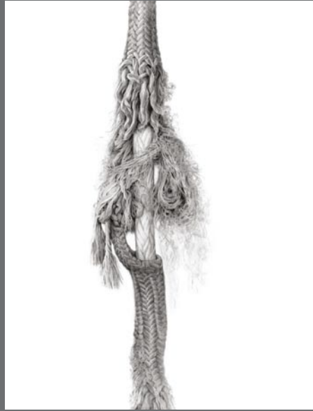
The Core, 50 inches x 38 inches, charcoal on paper, 2008