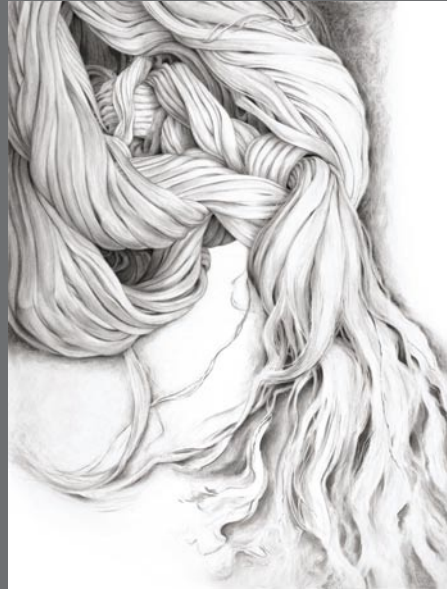
Outbound, 50 inches x 38 inches, charcoal on paper, 2008