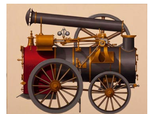
Work by Ward H. Nichols

Nichols says, "Although the rural scene has attracted a great deal of my attention, I feel a variety of subjects is essential for growth. I appreciate the differences and the challenge presented by each. I find that an abstract nature, a strong pattern, contrasts in color or shape influence what I paint. Currently, I am involved in experiments in the use of light and have added additional colors to my palette. Documenting the structures of our rural heritage remain a goal, and the older barns, homes and out-buildings of this area are featured in this pursuit. I have chosen oil paint as my primary media because I feel it is most expressive, and is more adaptable for the detailed work I prefer, as well as having proven durable