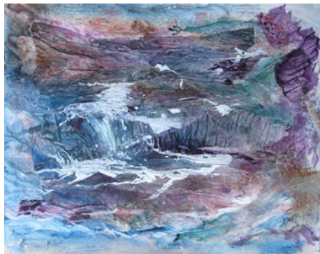
Work by Lynn Padgett

Past "Art at the Airport" exhibits have included fine photography, paintings, pot-