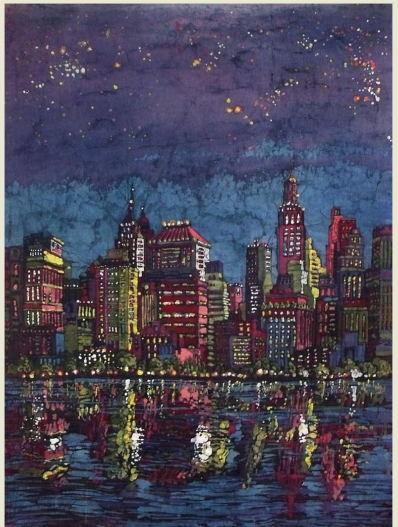
Mark Mulfinger Cityscape, 1990's Batik 48 x 60 inches