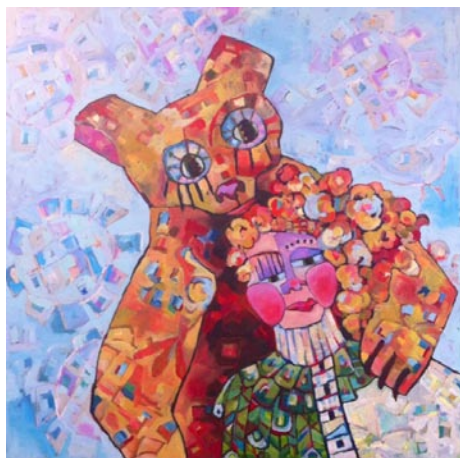
Work by Staci Swider

Swider prefers simple designs, reminiscent of American folk art churned up with Eastern European influences. In her work red line drawings are sandwiched between layers of acrylic paint, oil pastels and grease pencil, and slavic embroidery patterns are highlighted by passionate copper accents.