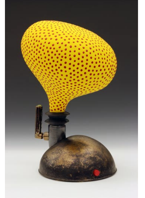
Work by Stephen Wolochowicz

Wolochowicz's current work utilizes continued above on next column to the right