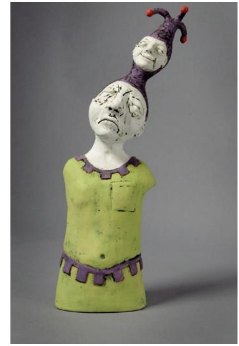
Work by Renee Rouillier

"As artists, we have the vision/gift to see and express life's circumstances, injustices, and extremes, others may choose not to see," adds Rouillier. "Art opens up such an arena of visual opportunities, an inner world full of potential just waiting to be explored. Although advancements of science