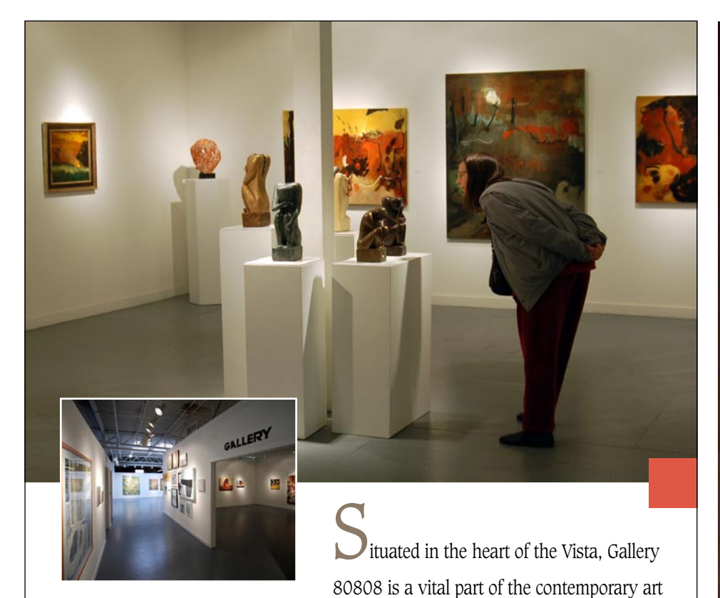
Exhibit in the Heart of the