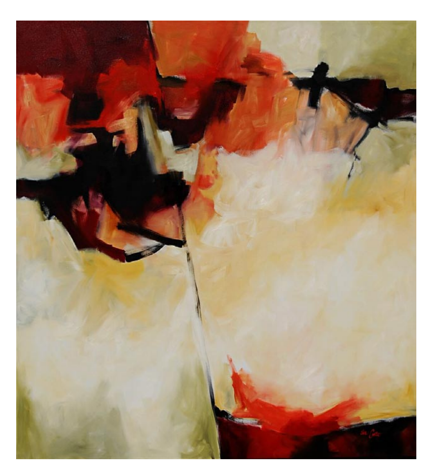
Fracture Oil on Canvas, 72 x 66 inches