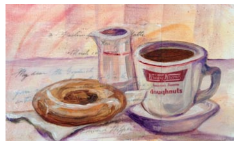
Work by Betti Pettinati-Longinotti

For further information check our NC Institutional Gallery listings or visit ( www. Artworks-Gallery.org ).