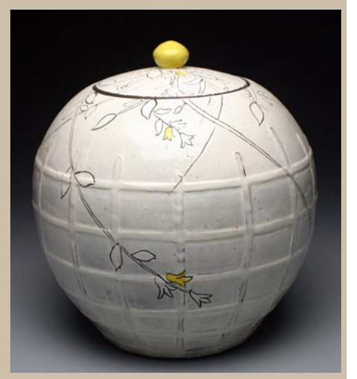
Work by Ben Carter

(http://www.carterpottery.blogspot.com/2009/05/welcome-totales-of-red-clay-rambler.html).