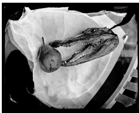
Work by Owen Riley

Skilled in digital color photography, fine art digital printing, and traditional film-based black-and-white archival photography, Riley also practices and teaches the 19th-century wet-plate collodion process. His work can be found in the permanent collections of the Greenville County Museum of Art, the Greenville Fine Arts