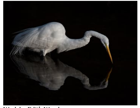
Work by Edith Wood

The SOBA photographers include both shutterbugs and professionals alike and are some of the best in the region. They are visual journalists, recording the beauty, and sometimes the unexpected, of our surroundings. They use their skills to show us new ways of seeing the world and create lasting impressions through their