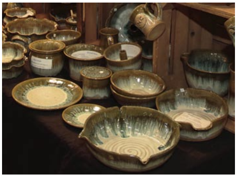
Works from Triple C Pottery

The Festival began 20 years ago to showcase Catawba Valley alkaline-glazed stoneware that was continuing to be made by local potters. Catawba Valley is one of three pottery producing areas in our state. Because our potters were firing predominately in wood-fired kilns, pottery was available for sale in large quantities at odd times. Marketing was by word-of-mouth - not the best approach. The original goal was to provide a place, one day a year, when Catawba Valley pottery could be purchased.