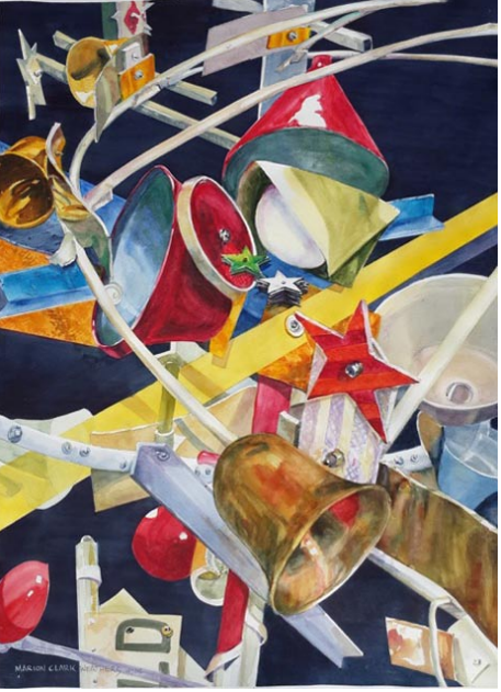
Work by Marion Clark Weathers

has captured the life and motion they have in a different way. Simpson's kinetic sculptures have evolved into kinetic works on canvas. Collectors can savor the excitement of a whirligig in a new medium. Whether a huge moving sculpture or a work on canvas, it is all about exploring shapes, motion, noise, paint application, color and depth.