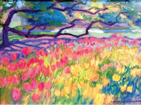
Work by Karen Crenshaw

The talents and hands of our local medical community are not only providing us with excellent care, but they also are the hands that provide us with wonderful artistic creations. Members of the medical