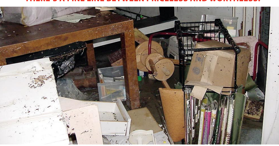
Artist Diane Falkenhagen's Texas studio — destroyed by flooding during Hurricane Ike, 2008

What would you do if you lost your work, your tools, your images, and a lot more to a flood? Metalsmith Diane Falkenhagen knows