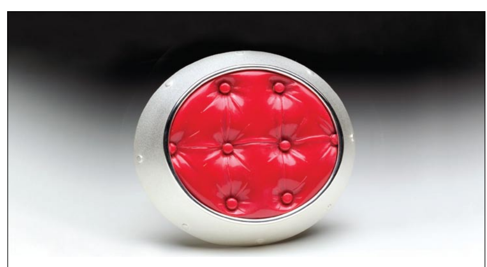
THERE'S A FINE LINE BETWEEN PRICELESS AND WORTHLESS.

Deep in the Lost Province of Ashe County, NC Studio visits by appointment, online anytime Google "Kosinski Studio" for directions 336-384-1145