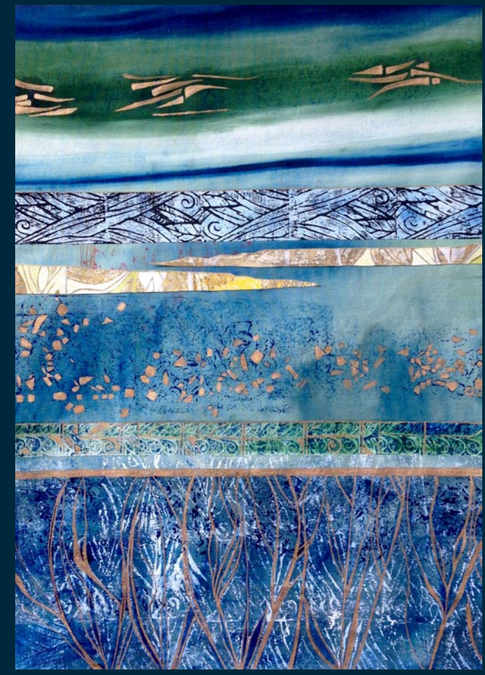
Prussian Blue Waterway