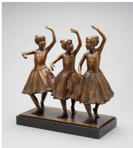
Work by Glenna Goodacre

The most popular of over 50 bronze Page 6 - Carolina Arts, March 2018