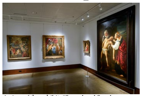
A view of the exhibit, "Sacred and Secular: Netherlandish Baroque Paintings from Regional Collections".

These diverse cultural forces are evident, in varying ways and degrees, in a selection of paintings in the exhibition, loaned to Wofford by the Bob Jones University Museum and Gallery in Greenville, SC;