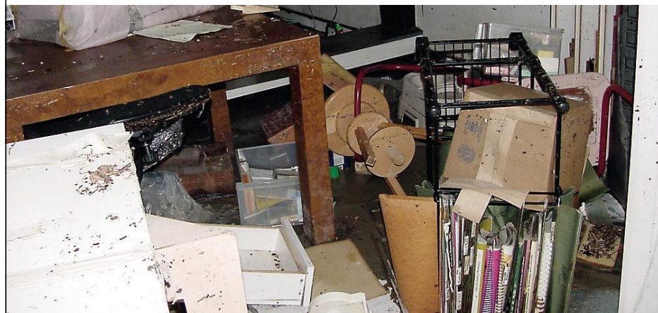
Artist Diane Falkenhagen's Texas studio — destroyed by flooding during Hurricane Ike, 2008

What would you do if you lost your work, your tools, your images, and a lot more to a flood? Metalsmith Diane Falkenhagen knows