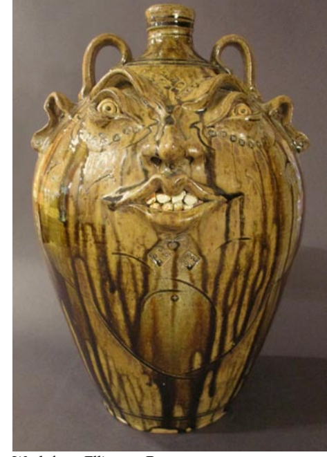
Work from Ellington Pottery (https://catawbavalleypotteryfestival.org/).

For further information check our NC Institutional Gallery listing or visit