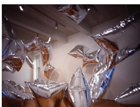
Andy Warhol and Billy Klüver, "Silver Clouds" [Warhol Museum Series], 1994, helium-filled metalized plastic film (Scotchpak), each 32 × 48 × 15 inches. Collection of The Andy Warhol Museum, Pittsburgh, IA1994.13. © The Andy Warhol Foundation for the Visual Arts, Inc. / Artists Rights Society (ARS), New York. Image courtesy The Andy Warhol Museum.

Morgan captured landscapes, children, and innovative photomontages, but her true legacy lives in her study of American modern dance pioneers from the 1930s and 1940s, with a special focus on dancer and choreographer Martha Graham. Dance critic for The New Yorker , Joan Acocella