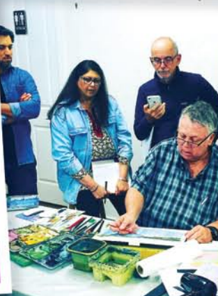
WORKSHOPS LED BY RENOWNED ARTISTS at SoBA's Center for Creative Arts