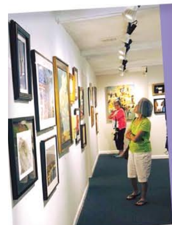
DISPLAY YOUR WORK in an Eclectic Art Gallery in Old Town Bluffton