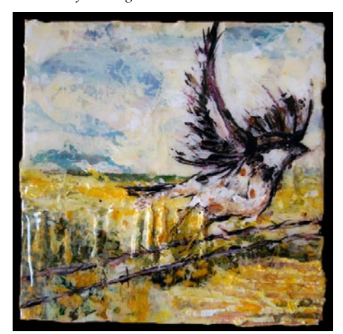
Work by Nathan Skinner

and degree offerings were expanded. The department now has 200 majors in four degree programs. Studio courses in both ceramics and fibers continue to be important offerings, in addition to those in drawing, painting, printmaking, photography, and computer design.